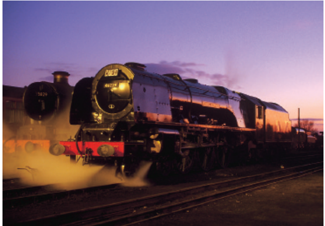
In superb lighting at dusk the National Railway Museum's 'Duchess of Hamilton' simmers on shed at the end of a day's work.