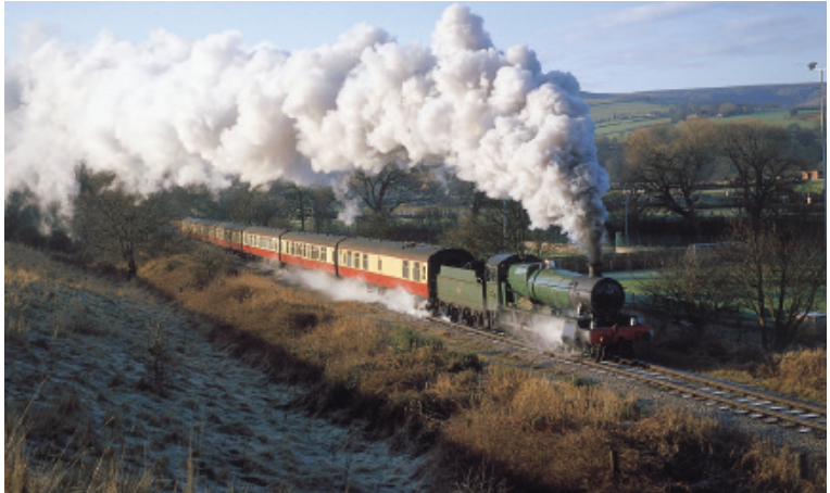
Above: The line climbs towards an overbridge which carries the original Bury to Haslingden turnpike road. This is a favourite viewpoint for photographers.