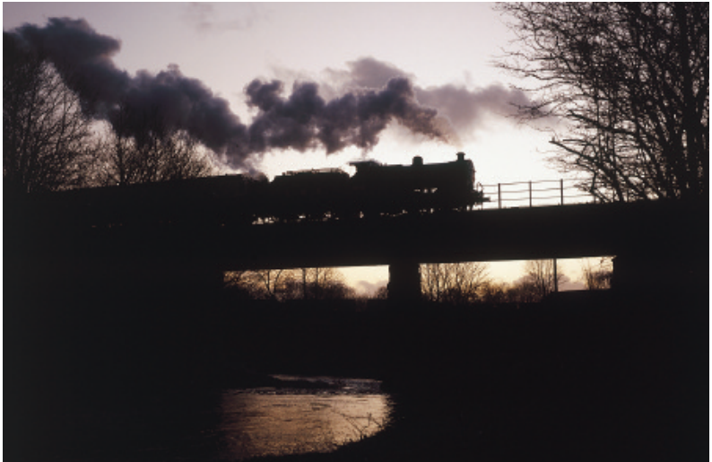
With the line running north-south at this location, a low winter's afternoon sun affords the opportunity to capture the train in silhouette as it crosses the bridge.